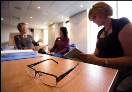
Social Enterprise and Community Working