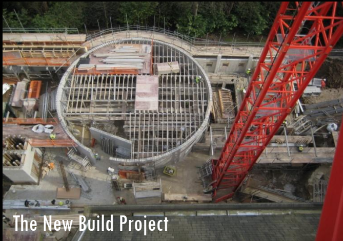
The New Build Project

PRME Principle 3: We will create educational frameworks, materials, processes and environments that enable effective learning experiences for responsible leadership