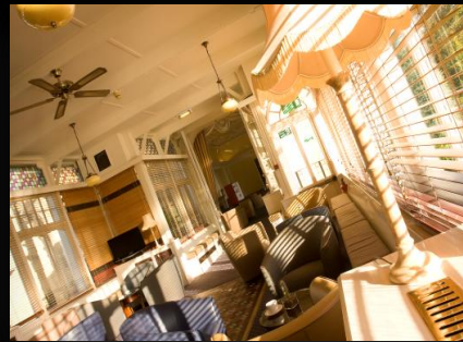
Sustainable Education Centre