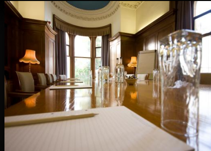
Working with Students

In the last 18 months, the School has embedded Knowledge Transfer within its mission statement.