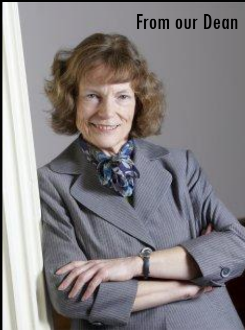
From our Dean