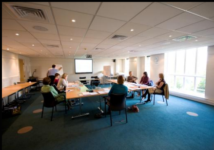
Knowledge Transfer Networks

PRME Principle 6: We will facilitate and support dialogue and debate among educators, business, government, consumers, media, civil society organisations and other interested groups and stakeholders on critical issues related to global social responsibility and sustainability