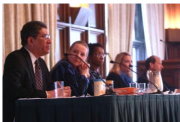
Panel at the Brennan Forum on Corporate Governance addressing "The Tension Between Corporate Governance and Corporate Social Responsibility."

The Power of Commerce for Social Good. We presented the first annual Center for Global Peace through Commerce symposium: "The Power of Commerce for Social Good." This half-day symposium brought together business leaders from the Chicagoland area, students and our keynote speakers for a series of dialog sessions on the topic.