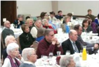
Attendees at a Center for Global Peace through Commerce program.

We will develop the capabilities of students to be future generators of sustainable value for business and society at large and to work for an inclusive and sustainable global economy.