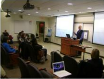
A Net Impact event centered on the humanitarian crisis in Haiti.

NetImpact . Founded in 2010, the mission of Net Impact Dominican University is to inspire, educate, and equip individuals to use the power of business to create a more socially and environmentally sustainable world. To fulfill its mission, Net Impact Dominican University remains committed to providing members with opportunities that