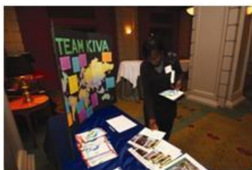
Team Kiva display at a Brennan School function.

Student Clubs. Students make important linkages between class and world through their extracurricular participation in student clubs. Kiva and a chapter of NetImpact give students opportunities to engage two global issues: poverty alleviation through microloans and long term environmental sustainability.