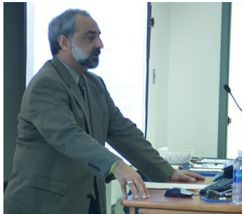
Speaker at "Peace in Pakistan" event.