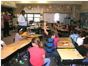
Brennan graduate alumnus works with local grade school children in the Center for Economic Education's "teach children to save day."

We will create educational frameworks, materials, processes and environments that enable effective learning experiences for responsible leadership.